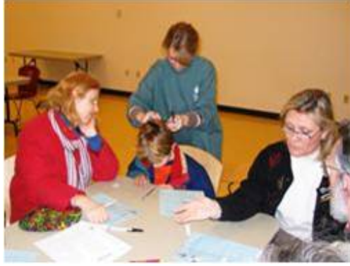
Community screening program for MeHg using hair samples