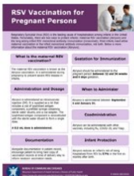
RSV Vaccination for Pregnant Persons, P-03654 (PDF)