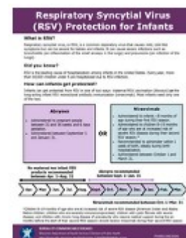
Respiratory Syncytial Virus (RSV) Protection for Infants, P-03653 (PDF)

New guidance from CDC to support RSV ordering and planning efforts for Alaskan Native and American Indian infants is now available.