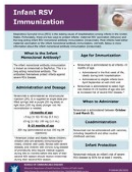
Infant RSV Immunization, P-03654A (PDF)