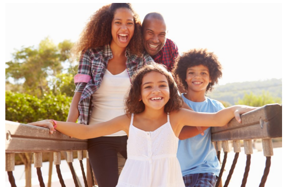
Happy, health, and lead-free!

We include a success story in every newsletter, but did you know you can find all of our past stories on our webpage? We are constantly adding in new stories from across Wisconsin about how folks are using Tracking data and resources to make a difference in their communities. Simply visit our resources page and click the "Success Stories" tab.