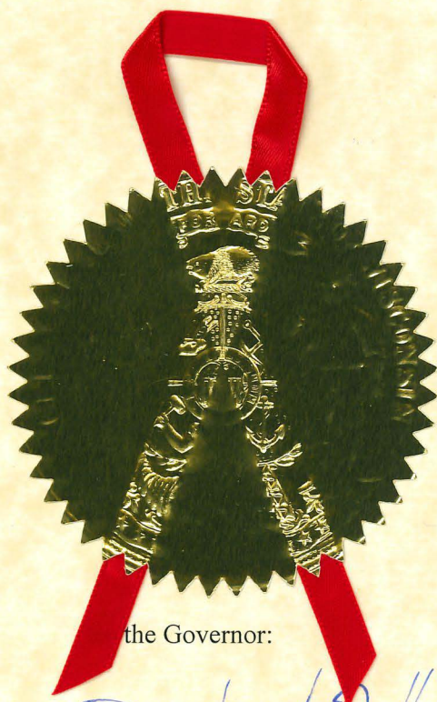
TONY EVERS GOVERNOR

IN TESTIMONY WHEREOF, I have hereunto set my hand and caused the Great Seal of the State of Wisconsin to be affixed. Done at the Capitol in the City of Madison this 6 th day of August 2020.