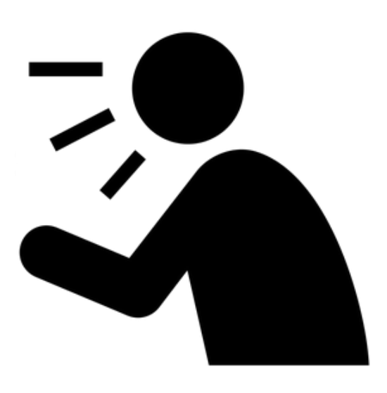
COUGHING UP BLOOD