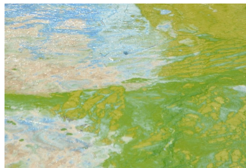
Looks like spilled paint or pea soup