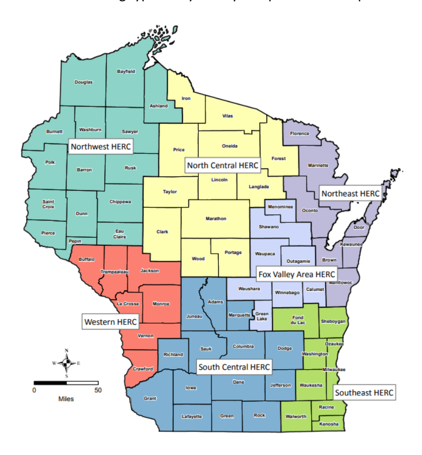
Figure 2: Map of Wisconsin's HERCs

The Administration for Strategic Preparedness and Response (ASPR) in the United States Department of Health and Human Services funds Wisconsin's Hospital Preparedness Program (HPP). The HPP supports seven regional healthcare emergency readiness coalitions (HERCs), shown in Figure 2 below. One of the purposes of these HERCs is to encourage coordination around emergency readiness among typical day-to-day competitors in the private health care sector, as well as other