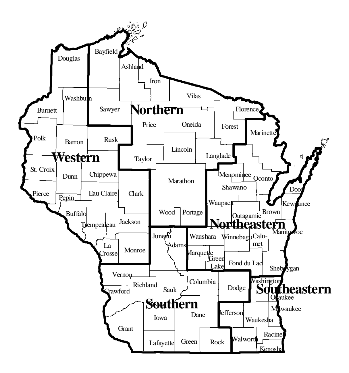
Map 2. Wisconsin Department of Health and Family Services Regions, 2004

Note: New Department of Health and Family Services regions were established in July, 1996 and again in February 2004. Effective with 2003 data, Vernon County was included in the Southern Region instead of the Western Region. Comparisons with regional data in previous publications may therefore be affected.