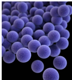
Methicillin-resistant Staphylococcus aureus (MRSA)

CA-MRSA txhais hais tias community-associated MRSA. Qhov no yog ib hom tshiab ntawm tus mob MRSA uas kheev pom muaj rau tsoom neeg sawv daws. Leej twg los yeej kis tau tus mob CA-MRSA, tab sis koj yuav kis tau tus mob sai dua yog koj cov tawv nqaij chwv tau lwm tus cov tawv nqaij, tawv nqaij to thiab khawb to, los yog kov tau tej cuab yeej siv qoj ib ce uas coob tus siv. Cov neeg ua football, cov sib ntswg sib qhau cev (wrestlers), cov neeg uas siv cov chaw qoj ib ce, cov me nyuam tsis tau muaj ob xyoos, thiab cov raug kee mus ua tub rog yog cov yuav kis tau tus mob CA-MRSA zoo tshaj.