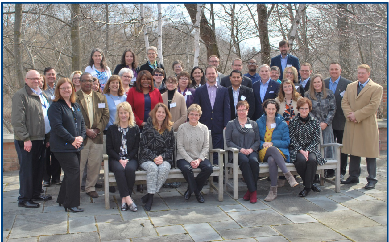
Participants at the 2018 Dementia Care Summit

Successful implementation of the priorities set forth in the Dementia State Plan will require the combined efforts of partners and stakeholders across Wisconsin. DHS wishes to express gratitude to all involved in the creation of the new State Dementia Plan, including The Johnson Foundation at Wingspread and the 2018 Summit participants, and to all who are or will be engaged in making it a success. To receive the latest news on the work of the Steering Committee and its workgroups, and to learn about opportunities to get involved, sign up for updates through DHS' Dementia Capable Wisconsin email sign-up .